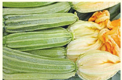
★ ROMANESCO - Grey-green with pale green flecks, prominent ribs, good flavour. Large vines, large edible male flowers. 52-60 days.