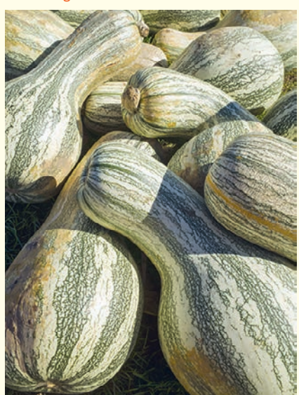
CUSHAW - GREEN STRIPED (Cucurbita mixta) - Green mottled stripes on greenish white skin, light yellow flesh, mild flavour similar to button squash, hard thin rind, pear shaped with bent neck, favourite for boiling, baking and pies. Heat tolerant trailing vine, 5kg to 7kg fruit stores well. Originates from the Caribbean. Sow spring and summer. 75 to 115 days.