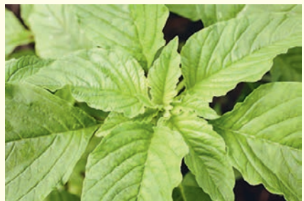
LEAF - GREEN CALLALOO - (CHINESE

Eden Seeds: Packet 450 seeds $3.70 Select Organic: Packet 450 seeds $4.20, 10g $9.00