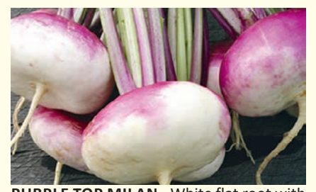
PURPLE TOP MILAN - White flat root with purple top, early producing. 30-35 days. Eden Seeds: Packet 200 seeds $3.70, 20g $6.00, 50g $14.00

ITALIAN CABBAGE (Brassica napa) - Very old large turnip swede with 2000 years of written history. It is buttery and tender and never woody no matter how big it gets, even people who are apprehensive about turnips and swedes love this one and it can be eaten raw. The root has been described as less attractive. Grows well all year round. Eden Seeds: Packet 180 seeds $3.70, 5g $8.00