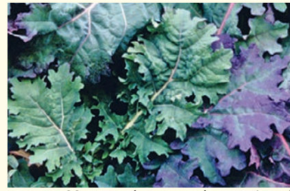
RED RUSSIAN - Blue green leaves tinged reddish and with purplish-red veins, tender sweet and mild flavour, use in salads when small, excellent boiled greens, known since 1885, vigorous plants 45-90cm, hardy to -10°C. 50-60 days.

Eden Seeds: Packet 120 seeds $3.70, 5g $6.00, 20g $19.00