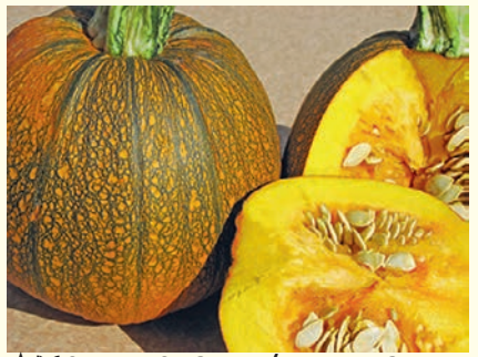
★ % SMALL SUGAR - (NEW ENGLAND

PIE) (Cucurbita pepo) - Orange fruit, flattened globe shaped to 30cm, stringless sweet thick yellow flesh reputed to be the best pie pumpkin. 80-118 days.