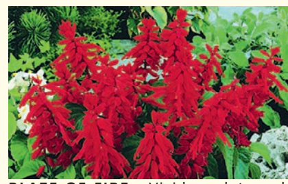
BLAZE OF FIRE - Vivid scarlet, early flowering plant to 30cm, still one of the best. Seed count: 300/g.

Hardy summer flowers perennial 30cm to 60cm from southern Brazil, nipping early buds encourages branching, best in full sun withstands heat, prefers well drained rich soil, sow after frost, all year in tropics.