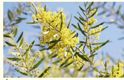
❖ TREES - ACACIA FIMBRIATA - (BRIS-BANE WATTLE) (Acacia fimbriata) - Bushy shrub or small tree to 4m. Excellent windbreak or orchard legume. Masses of yellow flowers in spring. Scarify seeds. Seed count: 175/g.

Eden Seeds: Packet 70 seeds $3.70, 10g $9.00