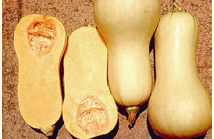
WALTHAM BUTTERNUT (Cucurbita moschata) - Small nutty flavoured pearshaped to 22cm and 2kg, flesh is light orange, dry and very tasty. Small seed cavity, vigorous vines. Grown in all states, good keeper. 83-115 days.

Eden Seeds: Packet 25 seeds $3.70, 20g $11.00, 50g $25.00, 100g $38.00