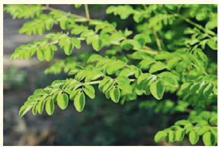
XTREES - HORSERADISH TREE

(MORINGA) (Moringa oleifera) - Also called Miracle Tree because of its high content of many minerals and vitamins. Leaf eaten when young and best cooked. Horseradish name because of its flavouring in cooking. Fast growing, subtropical to tropical ornamental, drought tolerant. Plant seeds direct in warmer months and keep watered to establish. Also strikes from cuttings over 25mm thick. Can be cut back in dormant times for new spring growth. Used for hedging and erosion control.