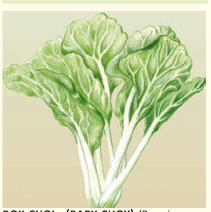
BOK CHOI - (BABY CHOY) (Brassica rapa pekinensis) - Chinese non-heading type cabbage, very productive, 20-30cm tall. Grown for its broad white stemmed leaf, use in stir-fry, pick often like silverbeet, small compact plant, resistant to bolting. Mildly pungent, hardy cool weather plant. sow autumn and spring in cooler areas. 60 days. Eden Seeds: Packet 120 seeds $3.70, 5g $7.00, 20g $18.00

(Brassica oleracea var. capitata) Possibly the most ancient of today's vegetables; cultivated for over 4000 years. Stores well in cool humid conditions. Likes rich well drained soil with pH above 6.0 and sunny position, keep well watered. Will cross-pollinate with other Brassicas to keep seed pure grow only one Brassica. Sow early spring, end of summer to winter, mature plants tolerate frost. Seed count: 200-380/g.