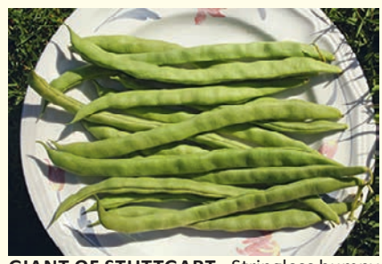
GIANT OF STUTTGART - Stringless bumpy pod, vigorous, heavy yielding, fine tasting, highly flavoured green bean. 22-25cm. 65-70 days.

Eden Seeds: Packet 40 seeds $3.70, 400g $19.00, 800g $30.40, 4kg $110.00