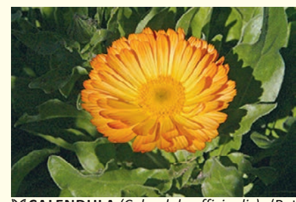
★ CALENDULA (Calendula officinalis) - (Pot marigold) Mostly 90mm orange flowers in mild climates. Hardy, long flowering time. Likes full sun. Seed count: 150/g.

Eden Seeds: Packet 70 seeds $3.70, 5g $6.00, 20g $18.00