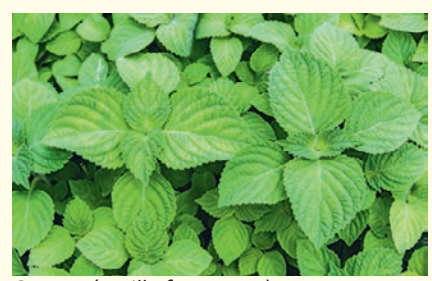
GREEN (Perilla frutescens) -Eden Seeds: Packet 90 seeds $3.70

Herb used in salads and cooking. Mild anise or licorice flavour. Called "shiso" in Japan and used in sushi, soups and noodle dishes, Chinese give it medicinal qualities. When cooked it is said to taste between mint and basil. In Korea it is called Perilla. Plants to 60cm. For best results, Perilla seeds should be cold stratified prior to sowing. To achieve this, mix the seeds with an equal quantity of moist sand and refrigerate (don't freeze) for a week.