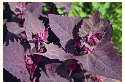
PURPLE ORACH (Atriplex hortensis) -Colourful addition to salads or micro green mixes. Seed count: 350/g.

Summer annual, use of leaves as a colourful salad ingredient or like silverbeet and spinach. Tall, long lived and hardy plant to 1m, but start using from 15cm, tolerates saline soils. Originally from the mountains of the Middle East. Sow spring, summer and autumn. 40 days.