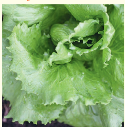
★ TROPICAL - Pale green iceberg type, round head, excellent heat tolerance and for bolting and tip burn.

Eden Seeds: Packet 60 seeds $3.70, 5g $10.00