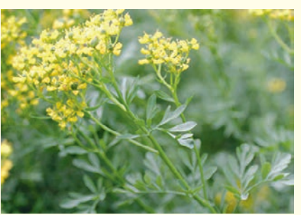
RUE (Ruta graveolens) - Perennial small aromatic shrub. Useful in eliminating worms. Repels fleas, ants, and flies. Sunny position, sow spring. Seed count: 800/g. Eden Seeds: Packet 250 seeds $3.70, 2g $6.00, 10g $24.00