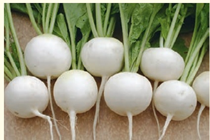
**HAILSTONE - (WHITE GLOBE) - Round with pure white skin, firm mild flavoured flesh. 23-30 days.

Eden Seeds: Packet 350 seeds $3.70, 20g $9.00