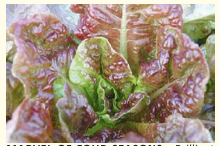
MARVEL OF FOUR SEASONS - Brilliant burgundy outer leaves, pale green heart, 19th century French heirloom. Heads 15-20 cm. Good flavour in summer but will bolt.

Eden Seeds: Packet 200 seeds $3.70 Select Organic: Packet 200 seeds $4.20, 5g $11.00