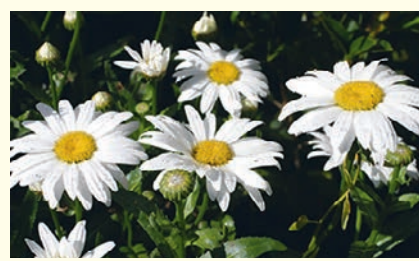
SHASTA DAISY -

Perennial showy bush of pure white flowers with yellow centre, bush to 60cm, good cut flower, frost hardy and drought tolerant when established. Deadhead regularly, rich moist well drained soil, sow after frost.