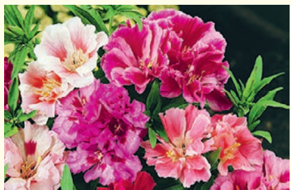
CAMELLIA FLOWERED MIX - Mix of violet, scarlet, rose and white, large double flowers, plant to 45cm. Seed count: 100/g.

Annual for flower beds, boxes and pots, excellent in moist shady positions, average soil, neutral pH, sow autumn and spring, winter and spring in tropics, keep seeds moist.