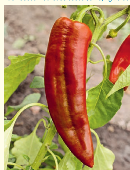
★ JOE E PARKER (Capsicum annuum) - Green turning red, narrow fruit to 170mm long, 40mm wide. Thick mild fleshed, popular New Mexico type, used grilled of stuffed.

Eden Seeds: Packet 35 seeds $3.70, 1g $8.00