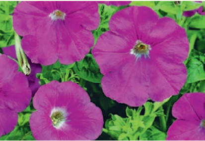
ROSE OF HEAVEN (Petunia nana compacta) - Mass of rose coloured single flowers on bushy compact plant to 30cm, ideal for borders and pots. (We cannot send to TAS.) Seed count: 8000/g.

Eden Seeds: Packet 2500 seeds $3.70, 2g $7.00