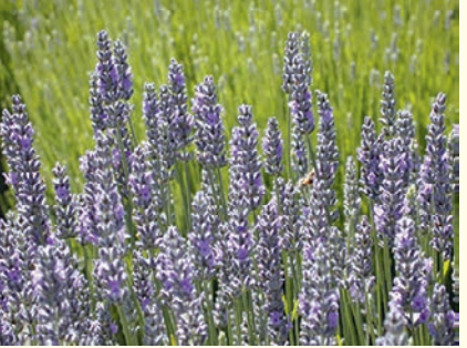
★ LAVENDER - TRUE (Lavandula vera) - Purple flowering perennial, true English type. Cut flower buds just before flowering, and dry. Wonderful perfume source, plant in garden borders. Use between linen for light perfuming, repels moths. Sow spring to early autumn.