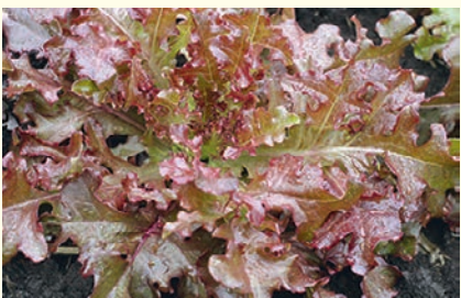
SALAD BOWL RED - Similar to Salad Bowl Green except leaves are bronze and inner leaves bronze red. 45-68 days.

Select Organic: Packet 200 seeds $4.20, 5g $9.00, 20g $29.00