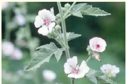
MARSHMALLOW (Althea officinalis) - Perennial to 1.5m, known for medicinal and soothing properties. Edible young leaves, flowers, seed pods and roots. Sow in spring. Seed count: 280/g.

Eden Seeds: Packet 40 seeds $3.70, 2g $7.00