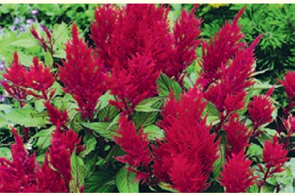
FOREST FIRE (Celosia argentea L.) - Showy scarlet flowers, dark foliage, semi dwarf variety 75-90cm. Seed count: 1500/g. Eden Seeds: Packet 500 seeds $3.70, 2g $6.00, 5g $10.00

Eden Seeds: Packet 500 seeds $3.70, 5g $8.00, 20g $22.00