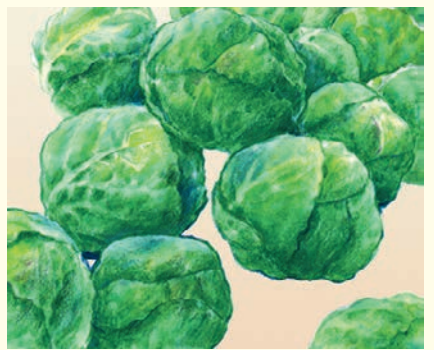
GRONINGER - Medium sized deep green sprouts, early producing. Seed count: 300/g. Eden Seeds: Packet 120 seeds $3.70, 5g $6.00, 20g $22.00

(Brassica oleracea var. gemmifera) Developed around Brussels in 1500's. Source vitamins A and C, iron, calcium and folic acid. Harvests over 8 to 10 weeks. Prefers a near neutral soil, trim lower leaves to allow sprouts to develop. Flavour improves with frost, stores well at high humidity and low temperatures and suited to freezing. Sow summer, autumn. Seed count: 225-300/g.