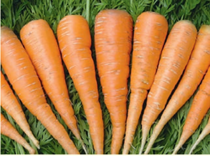
NEW KURODA - Deep orange root to 18cm long, 6cm diameter. Popular heat tolerant variety, high tolerance to leaf blight. Eden Seeds: Packet 1100 seeds $3.70, 20g $9.00

Eden Seeds: Packet 1100 seeds $3.70, 20g $7.00, 50g $14.00, 400g $110.00