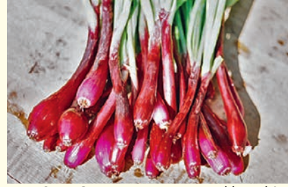
BUNCHING DEEP PURPLE - Red bunching variety which is highly coloured at all ages. Sow spring or summer in cooler areas. 60 days.

Salad onion, forms no bulb. Sow autumn to spring. (We cannot send to Tasmania) Seed count: 350-480/g.