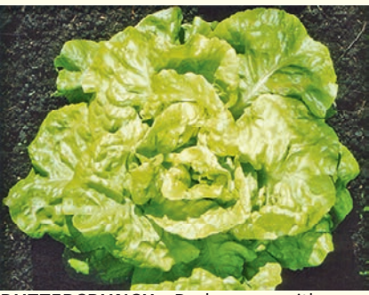
BUTTERCRUNCH - Dark green, with open and tightly bunched fan-shaped leaves, crisp and sweet, slow bolting. Highly rated

Eden Seeds: Packet 200 seeds $3.70, 5g $7.00, 20g $18.00, 100g $48.00