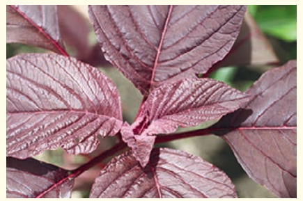
CHINESE SPINACH - AMARANTHUS

Eden Seeds: Packet 90 seeds $3.70, 10g $7.00, 50g $30.00