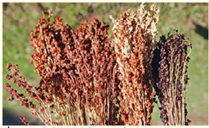
★ BROOM CORN ORNAMENTAL (Sorghum bicolor) - Tassel spikes used to make brooms, leaf and stalks can be used as fodder, plant looks like corn but is not a true corn, straw of mature plants is used for brooms, perennial in frost free areas, sow spring. 110 days.