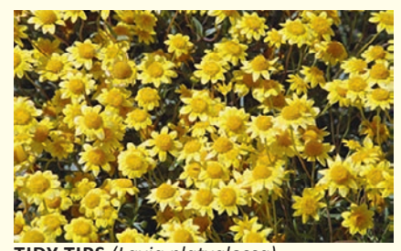
TIDY TIPS (Layia platyglossa) -Seed count: 1100/g. Eden Seeds: Packet 120 seeds $3.70