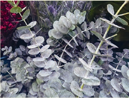
TREES - SILVER DOLLAR GUM (Eucalyptus cinerea) - Round silvery leaves used in floral arrangements.

Eden Seeds: Packet 35 seeds $3.70, 5g $5.00