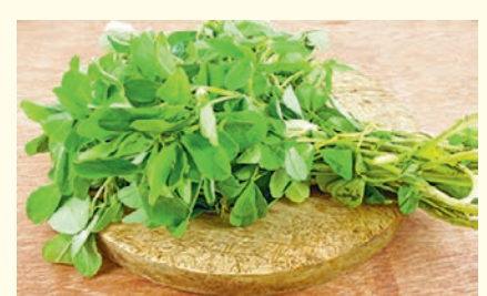
FENUGREEK (Trigonella foenumgraecum) Annual to 60cm. Seeds used to make tea to break up mucous congestion. Sprouts used sparingly in salads and ground for curries. Source of organic phosphorous. Sow Autumn, Winter, Spring. Seed count: 210/g. Eden Seeds: Packet 600 seeds $3.70,