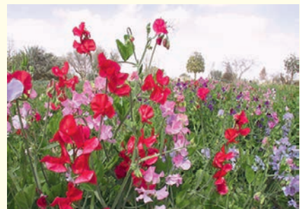
OLD SPICE - Heirloom variety, highly scented red flower, white striped, climbing to 2m. Long stem flowers, heat tolerant. Sow autumn, winter, spring in cooler areas. Eden Seeds: Packet 50 seeds $3.70, 20g $9.00