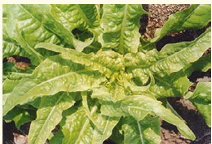
CELTUCE - NARROW LEAVED - Also called Asparagus lettuce, hearts eaten like a small lettuce. Used as Chinese vegetable by leaving till stem is 30cm. long, then peeled and sliced for stir-fry, use like celery cooked or in salads. Sow autumn, spring in cooler areas

Eden Seeds: Packet 200 seeds $3.70, 5g $6.00, 20g $14.00