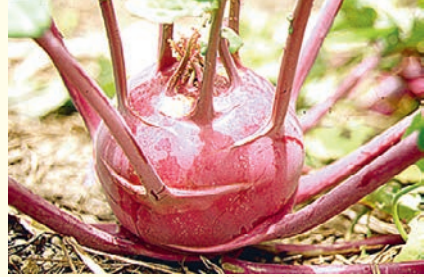
PURPLE VIENNA - Bulb and stems purple, flesh is white and sweet. 55-69 days. Eden Seeds: Packet 120 seeds $3.70, 5g $6.00