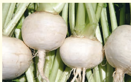
SNOWBALL - (WHITE EGG) - Old standard, pure white colour, use at about 9cm. Sow autumn and spring. 40-55 days.

Eden Seeds: Packet 350 seeds $3.70, 20g $8.00 Select Organic: Packet 350 seeds $4.20