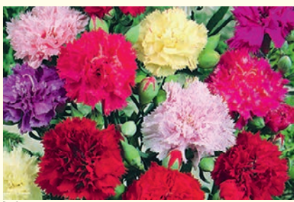
CHABAUD MIX - Range of colours, deeply fringed petals, double flowers, plants to 60cm, popular variety for beds and cut flower. Seed count: 500/g.

Hardy perennial, fragrant flowers, good in beds and most popular cut flower, nip tips when 15cm high to encourage branching, best results when old flower heads are also nipped, cut back healthy plants yearly, raised beds are recommended, well drained soil, sow seed in spring, autumn in warmer areas.