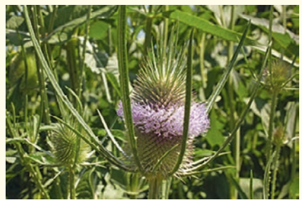
TEASEL -Eden Seeds: Packet 120 seeds $3.70, 5g $9.00

Comb-like flowerheads. Excellent in dried flower arrangements. The dried flowers were once used on the best woolen cloths to tease and raise the nap. Biennial, grows to 2m, likes moist soil and temperate climates.