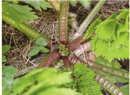
WHITE ALABASTER - Fine flavoured bulbs, harvest at 10cm. 120 days.

Eden Seeds: Packet 700 seeds $3.70, 5g $7.00