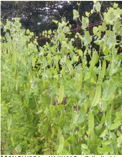
★ SNOWPEA - YAKUMO - Tall climbing Snowpea 2-2.5m,long flat pods to 13cm, purple flowers. (We cannot send to TAS.) Eden Seeds: Packet 50 seeds $3.70, 400g $19.00, 800g $34.00, 4kg $160.00

★ SNOWPEA - OREGON GIANT - Large dark green pods, plant to 1m tall, powdery mildew resistant and some root rot resistance. (We cannot send to TAS.) Eden Seeds: Packet 145 seeds $3.70, 400g $15.00, 800g $24.00, 4kg $110.00