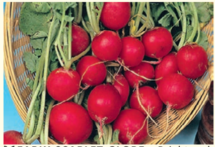
<u>KEARLY SCARLET GLOBE</u> - Bright red, white flesh, smooth round roots, harvest at 25mm.

Eden Seeds: Packet 180 seeds $3.70, 20g $8.00