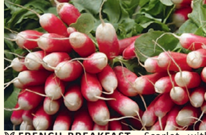
FRENCH BREAKFAST - Scarlet, with white rounded tip, oblong 5-8cm. Mild flavour, standard home garden variety since 1890. Cold resistant. 28 days.

Eden Seeds: Packet 350 seeds $3.70, 20g $7.00, 50g $14.00