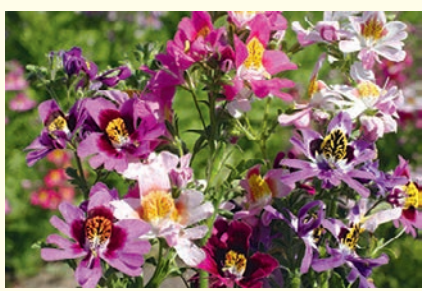
ANGEL WINGS MIXED - Masses of beautiful spotted flowers in shades of cream, pink, violet, blue and rose, fern like foliage plants to 35cm, excellent cut flower, also known as Poor Mans Orchid. Seed count: 1500/g. Eden Seeds: Packet 400 seeds $3.70, 2g $7.00

Annuals with orchid like flowers in shades of pink to violet, native to Chile, well suited to pot culture for early spring flowering, very adaptable, nip buds to spread the plant, thrives in semi-shade, sow summer to early winter, shallow sowing and exclude light for germination.