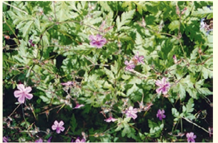
★ HERB ROBERT (Geranium robertanium) Annual to 30cm. Tea from the leaves used medicinally. Thrives in shady moist places. Sow in spring.

Eden Seeds: Packet 90 seeds $4.00, 5g $9.00