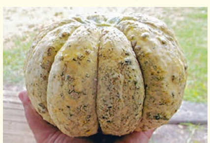
ZATTA - Very sweet orange flesh, ribbed and warted green and yellow skin, pick at this stage as it is over ripe when fully yellow. To 1.5kg.

Select Organic: Packet 18 seeds $4.20, 10g $9.00, 50g $36.00