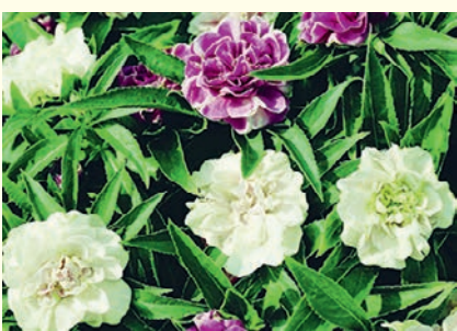
TOM THUMB - Mix of rose, salmon, scarlet, violet and white, top flowering for beds, dwarf type to 20cm, profusion of flowers until first frost. Seed count: 100/g.

Eden Seeds: Packet 150 seeds $3.70, 5g $7.00