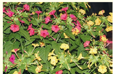
TALL MIX - Range of beautiful colours, pretty trumpet shaped flowers, bushy plant. Seed count: 25/g.

Perennial to 90cm, annual in cold areas. fragrant flowers open late afternoon till morning, use in the background, taken from Peru in sixteenth century, full sun, tolerates dry conditions, any average soils, sow after frost.