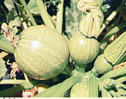
★ RONDO DE NICE - Small round, medium green mottled yellow, exceptional flavour, skin bruises easily, prolific bearing. 45 days.