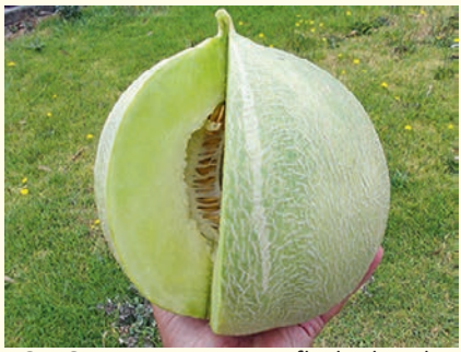
<u>POMONA</u> - Large green fleshed melon 2-3kg, delicious tasty melon developed by 'Garden Larder' for Australian home gardeners. Ripe when skin colour lightens. Eden Seeds: Packet 12 seeds $4.00

<u>SWEET PASSION</u> - Sweet orange flesh, fine aromatic flavour. Vine has some drought and wilt resistance.