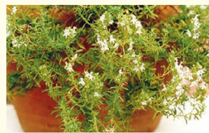
SAVORY - WINTER (Satureja montana) -

Perennial to 45cm, with similar properties as hortensis though stronger. Use as flavouring. Sow autumn and spring in cooler areas. Seed count: 1400/g.