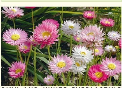
PINK AND WHITE EVERLASTING (Rhodanthe chlorocephala) - Also called Pink Paper-Daisy. The spectacular mass display known in Western Australia and southern S.A., hardy adaptable ground cover 20-60cm. Adapted to well drained sandy soils. Sow spring or other times if warm and well watered. 70-85 days.