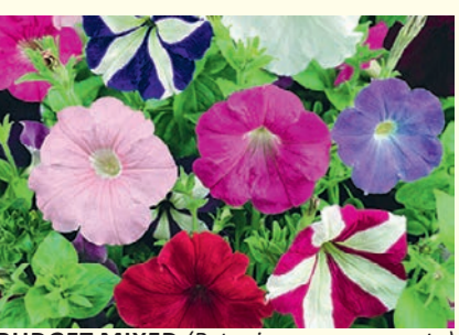
BUDGET MIXED (Petunia nana compacta) Mix of colours, plants to 30cm. (We cannot send to TAS.) Seed count: 8000/g.

Colourful and scented summer annual, hardy plant to 20cm, after first flowering trim plants back, use as ground cover and in pots and hanging baskets, likes full sun and wide range well drained soils, sow after frost in seed tray, cooler months in tropics, leave seeds uncovered. (We cannot send to TAS)