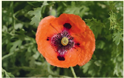
FLANDERS POPPY - (CORN POPPY) -

A most popular late winter and spring flower, used as a cut flower, nip early buds for good clumping, removed finished flowers to prolong flowering, requires a warm sunny spot, average soil, neutral pH, sow direct late summer and autumn, autumn and winter in warmer areas.