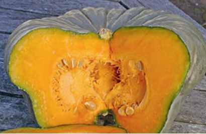
★ QUEENSLAND BLUE (Cucurbita maxima) Large pumpkin, dark slate grey heavily ribbed skin. Sweet, deep orange flesh. Top keeping pumpkin. 100-140 days.

Eden Seeds: Packet 10 seeds $3.70, 20g $20.00