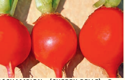
★ CHAMPION - (CHERRY BELLE) - Deep red, smooth oval shape to 40mm. Firm crispy white flesh, mild. Sow any time, withstands cold. 30-35 days.

Eden Seeds: Packet 180 seeds $3.70, 20g $6.00, 50g $12.00