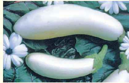
★ <u>CASPER</u> - Popular white fruit 5cm x 15cm, mild flesh, quick producing. 90 days. Eden Seeds: Packet 40 seeds $3.70, 1g $6.00