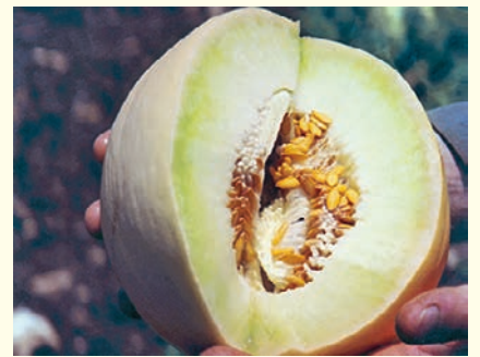
HONEYDEW - Green flesh, smooth skin, thick sweet flesh. Slow growing, best suited to warmer dry climates, good for shipping and storage. 95-105 days.

Eden Seeds: Packet 25 seeds $3.70 Select Organic: Packet 25 seeds $4.20