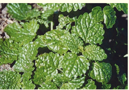
LEMON BALM (Melissa officinalis) - "Bee herb". Delicious fragrant flavour, best of all in teas and summer drinks. Helps relaxation. Easy to grow, perennial to 1m. Sunny sheltered spot, spring planting. May die down in winter. Seed count: 2300/g.

Eden Seeds: Packet 360 seeds $3.70, 1g $5.00