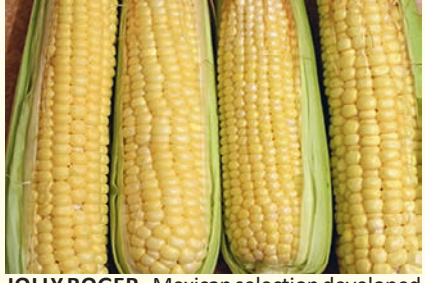
JOLLY ROGER - Mexican selection developed in Australia, fine quality, heavy bearing. (We cannot send to WA.)

Eden Seeds: Packet 50 seeds $3.70 Select Organic: Packet 50 seeds $4.20, 400g $21.00, 800g $30.40, 4kg $128.00, 20kg $500.00