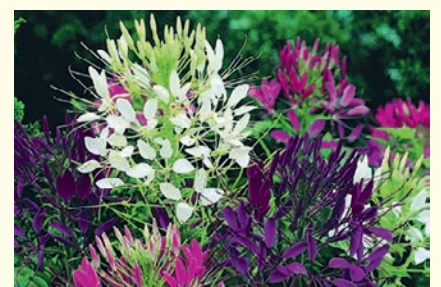
FOUR QUEENS MIX - Rose, lilac, mauve and white flowers. Seed count: 500/g. Eden Seeds: Packet 300 seeds $3.70

Eden Seeds: Packet 300 seeds $3.70, 10g $9.00, 50g $40.00