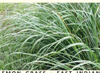
<u>LEMON GRASS - EAST INDIAN</u> (Cymbopogon flexuosus) - Source of lemongrass oil, used as flavouring and used in Thai and Vietnamese cooking, leaves make a good tea, add to potpourris. Seed count: 2000/g.

Eden Seeds: Packet 360 seeds $3.70, 1g $5.00