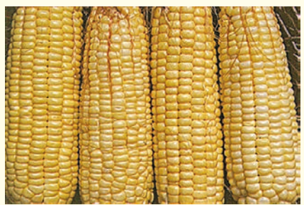
BALINESE - Two light yellow kernelled, medium sized cobs per, tall 2m plant. Thick stalk and heavy foliage also make it a good fodder and cover crop plant.