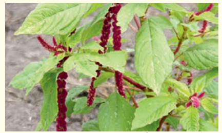
LOVE LIES BLEEDING (Amaranthus caudatus) - Ropes of red trailing blooms, plants to 90cm, edible leaves and seeds. Seed count: 900/g.

Hardy annual, excellent bed plant, prefers sunny dry area, average well drained soil, sow after frost.