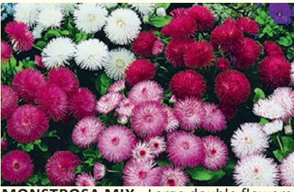
MONSTROSA MIX - Large double flowers, mix of pink, red and white.

Perennial plant to 15cm, can be used as an annual, used in borders, semi-shade or full sun, sow seed in autumn, also spring in cooler areas.