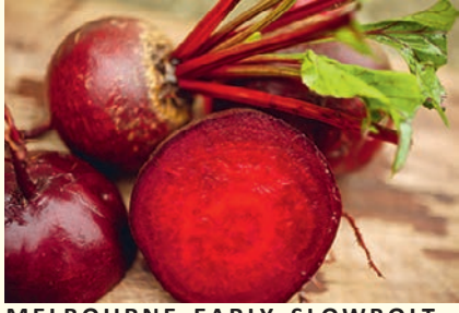
MELBOURNE EARLY SLOWBOLT -

Eden Seeds: Packet 110 seeds $3.70, 10g $16.00