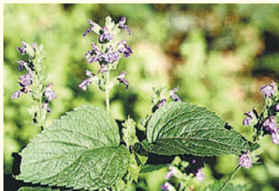
WHITE SEED - Also increasingly used in home cooking. Useful gel from soaked seeds is a food thickener to replace fat, increase fibre whilst reducing calories. Useful in salad dressings, yoghurt, dips and spreads. Does not effect the natural taste and flavours. Eden Seeds: Packet 12000 seeds $3.70

Eden Seeds: Packet 12000 seeds $3.70, 50g $7.00, 100g $12.00