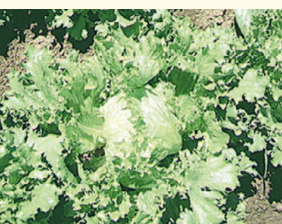
GREAT LAKES - Large sized heading Iceberg variety, dark green crumpled leaves with firm heart. Sow autumn, spring and summer. Resists early bolting. Matures by 12 weeks. 80-90 days.

Eden Seeds: Packet 200 seeds $3.70, 5g $6.00, 20g $13.00, 100g $35.00, 400g $120.00