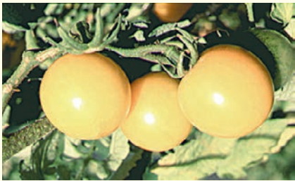
TOMMY TOE, YELLOW - Cherry shaped fruit 20-40mm.

Eden Seeds: Packet 60 seeds $3.70, 1g $6.00