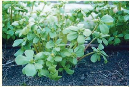
LARGE YELLOW (Portulaca oleracea sativa) Large juicy leaves, pick back to 50mm and allow to regrow. Sow after frost. 50 days. Seed count: 2000/g.

Eden Seeds: Packet 600 seeds $3.70, 10g $6.00