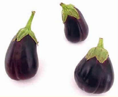
BLACK BEAUTY - Old standard, purplishblack smooth oval fruit to 160mm, fine flavour, bushy spreading plant to 80cm., does well in southern areas. 72-85 days. Eden Seeds: Packet 60 seeds $3.70, 5g $6.00, 20g $19.00, 100g $45.00 Select Organic: Packet 60 seeds $4.20

From India, developed in Spain in 16th century. Growing conditions as for tomato, though Eggplant needs a longer growing season, treat as perennial in warmer climates, annual in cooler areas. Can sow indoors up to 8 weeks before transplanting, harden for one week by taking off heat and put in full sun. Picking regularly encourages production. Sow early spring. Seed count: 200-250/g.