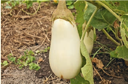
SNOWY - Productive, ivory coloured, long fruit. Sow spring and summer.

Eden Seeds: Packet 50 seeds $3.70, 5g $8.00, 10g $15.00, 50g $62.00