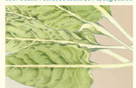
ERBETTE - Pale green leaf, thin rib, excellent texture and flavour.

Eden Seeds: Packet 50 seeds $3.70, 20g $12.00