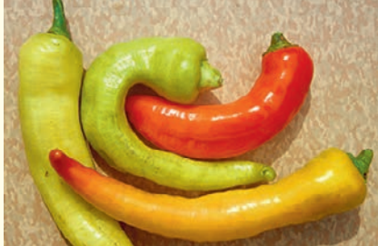
HUNGARIAN YELLOW WAX SWEET -Sweet light yellow changing to orange red. Thin tapered cylindrical fruit up to 18cm x 4cm. 70-84 days.