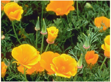
SINGLE FLOWERED MIX - Annual to 30cm, in a mix of golden shades, silvery green fern like foliage. Sow spring and summer.

Hardy annual to 30cm, good flower bed and border plant, easy to grow and withstands heat, flowers through-out warmer months, cut flower, likes full sun, will grow in poor soils, sow spring and summer, sow direct or start early and transplant.