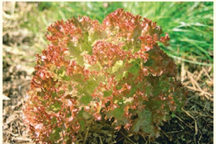
LOLLO ROSSO - Deeply curled looseleaf, beautiful magenta leaves, light green base. 30 days baby, 55 days full size.

Eden Seeds: Packet 200 seeds $3.70 Select Organic: Packet 200 seeds $4.20, 5g $11.00