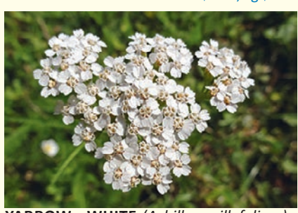
YARROW - WHITE (Achillea millefolium) -White flowering variety, the preferred for medicinal use. Seed count: 7600/g. Eden Seeds: Packet 600 seeds $3.70

Eden Seeds: Packet 2500 seeds $3.70, 5g $9.00