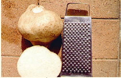
YAM BEAN - (JICAMA OR MEXICAN

WATER CHESTNUT) (Pachyrrhizus erosus) Climbing perennial from Central America. Edible part is tuber eaten raw or cooked has the texture of raw apple, sweet white crisp flesh, high quality starch, when cooked it retains its crispness and is often used in Chinese dishes in place of water-chestnut and bamboo shoots. Beans and pods are inedible, containing rotenone - a potent insecticide. Sow tubers and seeds as soon as frost is over in milder climates. Larger tubers when flowers and pods are pruned off. Space about 10-20 cm. apart.