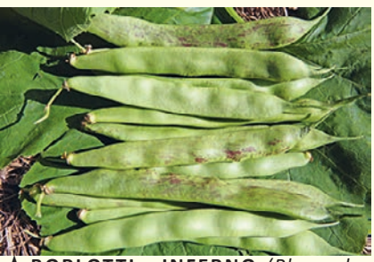
* BORLOTTI - INFERNO (Phaseolus vulgaris) Popular in Italian and Portuguese cuisine