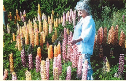
★ RUSSELL MIX - Mix of pink colours, sow late summer and autumn. (We cannot send to WA or TAS.) Seed count: 60/g. Eden Seeds: Packet 20 seeds $4.00