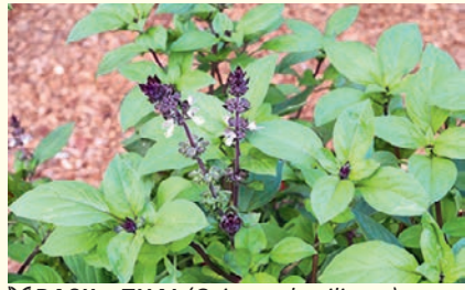
※BASIL - THAI (Ocimum basilicum) - Seed count: 1000/g.

Select Organic: Packet 250 seeds $4.20, 5g $5.00, 20g $18.00