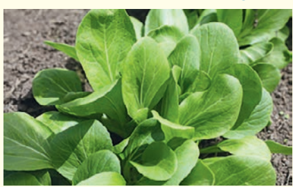
PAK CHOI - GREEN - Thick green leaves with light green stems, round open leaves,

Eden Seeds: Packet 60 seeds $3.70, 5g $7.00