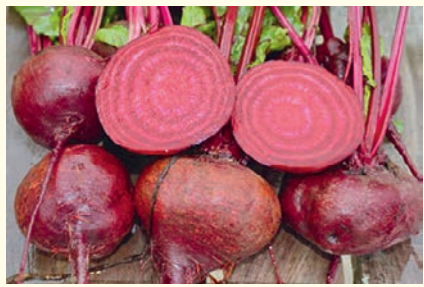
EGYPTIAN - Early flat-round variety, dark red with lighter zones, with delicious green tops. 55 days.

Eden Seeds: Packet 160 seeds $3.70, 50g $10.00, 400g $70.00