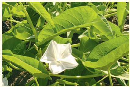
KANG KONG - (WATER SPINACH OR

ENTSAI) (Ipomoea aquatica) - Short tropical vine, narrow leaf variety, also known as water spinach, very suited to moist hot situations. Young shoots eaten raw or cooked, older shoots cooked. Likes swampy places. Best over 15°C. Seed count: 28/g. Eden Seeds: Packet 50 seeds $3.70, 10g $6.00, 100g $35.00