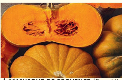
★ MUSQUE DE PROVENCE (Cucurbita moschata) - Ribbed flat tan fruits 3 to 6kg, thick deep orange fruit, moderately sweet, long storage. 125 days.