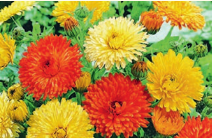
PACIFIC BEAUTY MIXED - Large flowers, mix of yellow, orange, apricot and cream, plants to 60cm. Seed count: 140/g. Eden Seeds: Packet 200 seeds $3.70, 10g $5.00, 20g $8.00, 100g $22.00

Eden Seeds: Packet 200 seeds $3.70, 20g $7.00, 100g $28.00