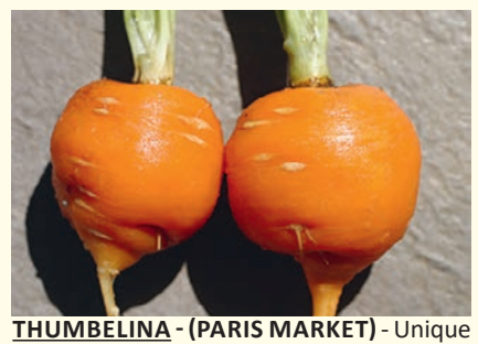
round orange root, French heirloom, up to 50mm. Sought after by restauranteers. Doesn't need very deep soil. 70 days. Eden Seeds: Packet 600 seeds $3.70