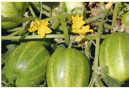
RICHMOND RIVER GREEN APPLE - Old Australian round apple variety.

Eden Seeds: Packet 25 seeds $3.70, 10g $9.00, 50g $38.00