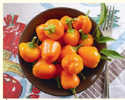
★ MINI ORANGE - Popular small sweet orange fruit to 60mm, born upright on the plant, very productive decorative plant to 60cm, easy to grow, use raw or cooked, an apple corer will take out the stem and seeds. Eden Seeds: Packet 18 seeds $3.70