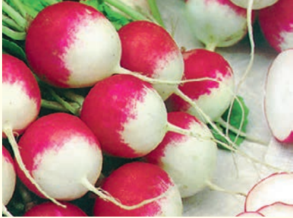
★ SPARKLER - Bright scarlet skin with lower 1/3 being white tip, sweet juicy white flesh, 30mm round to oval. 24-48 days.

Eden Seeds: Packet 180 seeds $3.70, 20g $9.00, 50g $18.00