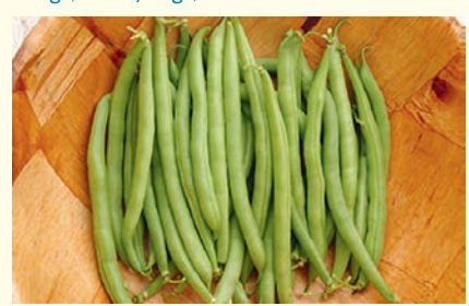
GOURMET DELIGHT - Glossy dark green bean, stringless to 16cm. 53-60 days. Eden Seeds: Packet 120 seeds $3.70, 400g $11.00, 800g $20.00, 4kg $95.00