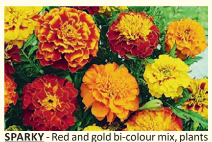
to 30cm. Seed count: 360/g. Eden Seeds: Packet 400 seeds $3.70, 10g $8.00, 50g $29.00