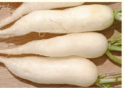
WHITE ICICLE - White skinned root to 15cm. Tender and mild flavour. Does not go pithy like other varieties when mature. Best summer variety. Sow all year. 40-60 days.

Eden Seeds: Packet 160 seeds $3.70, 10g $9.00