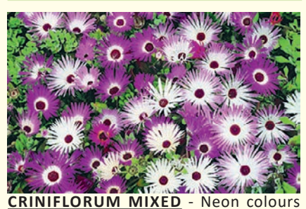
CRINIFLORUM MIXED - Neon colours including rose, crimson, buff, pink, primrose and golden apricot flowers, short plant to 10cm. Seed count: 3700/g.

Annual which flowers late winter and spring, low growing, ideal for carpeting, borders and rockeries, needs full sun for flowers to open, tolerates heat and dry, likes well drained soil, sow autumn and spring in cooler areas.