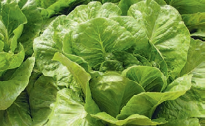
<u>DOV</u> - Dark green romaine type, extra sweet, heat tolerant, tip burn and wide range of other disease resistance. <u>Select Organic: Packet 200 seeds $4.20</u>

Select Organic: Packet 200 seeds $4.20, 5g $7.00, 20g $16.00, 100g $60.00