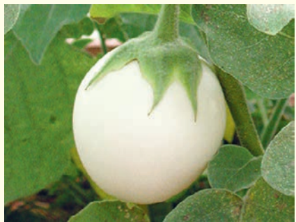
★ WHITE EGG - (JAPANESE) - Small oval fruits, more spicy flavour, sets early and continuously through season, winter pot plant 69-75 days.

Eden Seeds: Packet 20 seeds $3.70, 2g $6.00, 10g $22.00