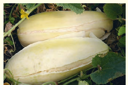
INDIAN CREAM COBRA MELON - Drier flesh. Splits when ripe. Sweeten with honey if desired.

Eden Seeds: Packet 25 seeds $3.70 Select Organic: Packet 25 seeds $4.20