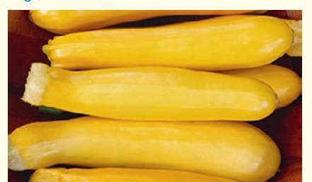
★ ★ GOLDEN - Bright golden fruits, medium long cylindrical shape, good flavour, bushy plant. 54 days.