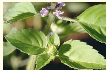
★ BASIL - HOLY (Ocimum sanctum) - SACRED BASIL or Tulsi, slender green leaves, hairy purplish stem, musky and slightly mint scent, often grown in houses, gardens and near temples in India, said to be a tonic aiding digestion, use in salads.

Eden Seeds: Packet 250 seeds $3.70, 10g $6.00, 50g $20.00