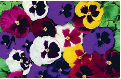
SWISS GIANTS MIXED - Seed count: 850/g. Eden Seeds: Packet 150 seeds $3.70, 2g $9.00, 10g $40.00

Hardy annual to 20cm, familiar multicoloured flowers, excellent in flower beds or containers, edible flowers, often as pressed flower, sunny or partly shaded position, heat and cold tolerant, sow summer and autumn.