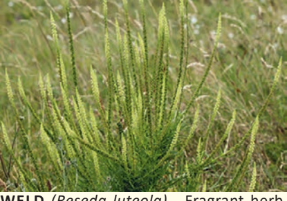
WELD (Reseda luteola) - Fragrant herb, leaves and yellow flowers used for dying, biennial, best in neutral or alkaline soils, likes sunny position.

Eden Seeds: Packet 1300 seeds $3.70, 2g $6.00, 10g $24.00