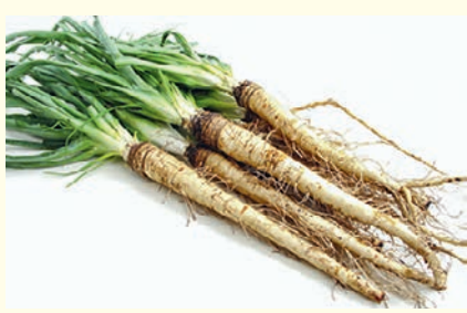
MAMMOTH SANDWICH ISLAND (Tragopogan porrifolius) - Oyster-like flavour, 6cm wide root tapered to 22cm long. Seed count: 80/g.

Delicious white fleshed root crop, cultivate as for carrots and parsnips, though can be transplanted, use root like parsnip fried or boiled, new winter shoots give a nice flavour to salads, can over winter, young plants withstand light frost, mature plants withstand heavy frost. Roots store well at low temperatures and high humidity. Sow autumn and spring in cold climates. 110-180 days. Seed count: 60-80/g.