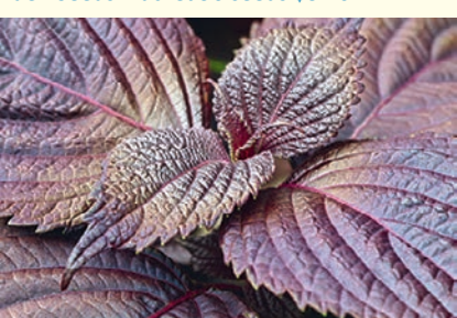
RED - (CRISPA) (Perilla frutescens) -Eden Seeds: Packet 90 seeds $3.70