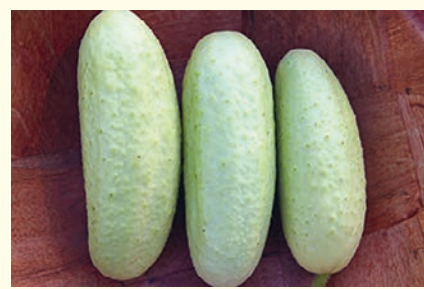
LONG WHITE - Good in salads or pickled. Fast grower. Excellent "apple" flavour. Tolerant of powdery mildew. 63-70 days. Eden Seeds: Packet 25 seeds $3.70