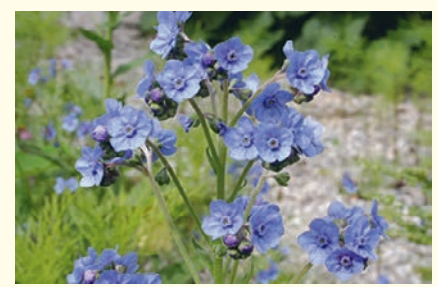
CHINESE FIRMAMENT BLUE (cynoglossum amabile) - Dainty blue flower, hardy plant, sow anytime. (We cannot send to WA.) Seed count: 185/g.

Hardy annual plant to 70cm, dainty blue flowers, excellent cut flower, full sun or part shade, sow anytime, best in autumn. (We cannot send to W.A)