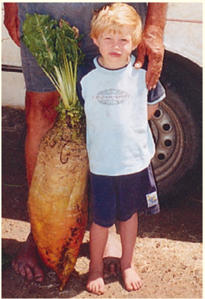
YELLOW ECKENDORF - (MANGEL) -Fodder beet, orange-yellow flesh and skin. Eden Seeds: Packet 220 seeds $3.70, 50g $18.00, 400g $95.00

YELLOW SUNRISE - Yellow orange, uniform globe, also fine edible beet leaves. Eden Seeds: Packet 100 seeds $3.70, 10g $16.00