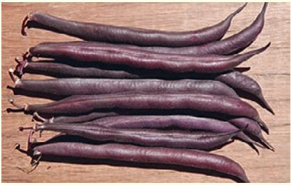
ROYAL BURGUNDY - Purple pods turn dark green when cooked (magic) round stringless pods 150mm to 170mm, erect bush to 45cm, good yields, suited to cooler soils. 50-60 days.

Eden Seeds: Packet 70 seeds $3.70, 400g $14.00, 800g $26.00, 4kg $110.00