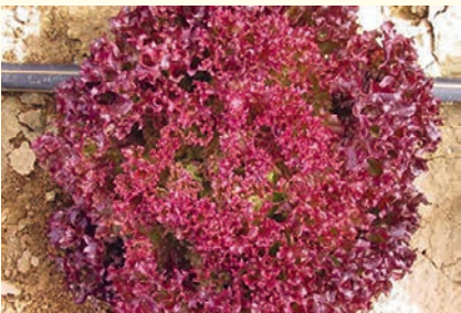
★ GLORIA - Red double curled Lolla Rossa type.

Eden Seeds: Packet 200 seeds $3.70, 5g $5.00, 20g $13.00, 100g $48.00