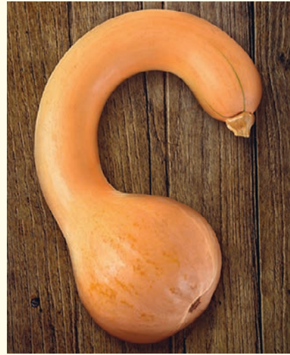
**PENNSYLVANIA DUTCH CROOKNECK (Cucurbita moschata) - Sweet orange flesh, nutty flavour, ancestor of Butternut variety. Long curved neck, popular Amish vairety. 130 days.

Eden Seeds: Packet 10 seeds $3.70, 20g $20.00