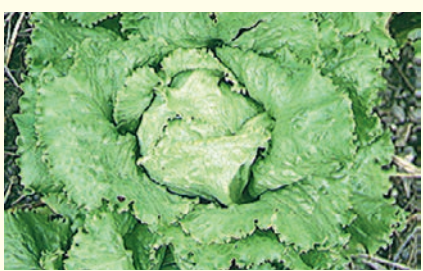
WEBB'S WONDERFUL - Large sweet dark green heading type, wrinkled leaves with firm crisp white heart, slow bolting. Sow spring, autumn and excellent summer variety. 64-87 days.