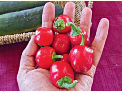
★ MINI RED - Sweet red fruit to 60mm, plant to 60cm, similar to mini orange except the fruit hang down on the plant.