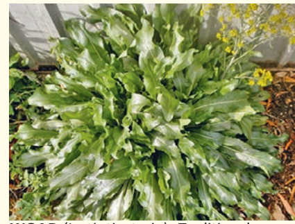
WOAD (Isatis tinctoria) - Traditional source of blue dye, hardy plant. (We cannot send to WA.)

Eden Seeds: Packet 600 seeds $3.70, 2g $7.00