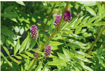
LICORICE - EUROPEAN (Glycyrrhiza glabra) Used medicinally since ancient times, now as confectionery and flavouring medicine, root up to 50 times sweeter than sugar, tall perennial legume, harvest after three years, replant roots or scarified seed in spring or autumn. Seed count: 100/g.