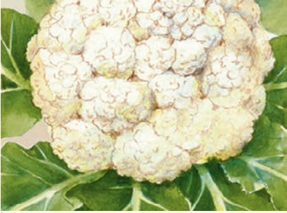
★ SNOWBALL - Tight solid 15cm heads, crisp and tender, excellent quality, well suited to warmer regions. 70-90 days. Eden Seeds: Packet 90 seeds $3.70, 5g $6.00 Select Organic: Packet 90 seeds $4.20

★ ※ ROMANESCO - Green minaret type. Eden Seeds: Packet 90 seeds $3.70, 5g $6.00