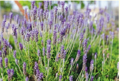
★% LAVENDER - SPANISH (Lavandula dentata) - Strongly fragrant indented leaves, light purple flower, also good in pots. Eden Seeds: Packet 30 seeds $3.70