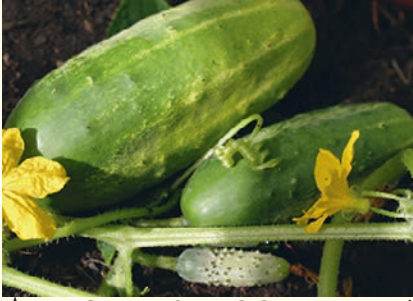
★ NATIONAL PICKLING GHERKIN - Dark green fruit, short thick and blunt-ended when small. 50-58 days.

Eden Seeds: Packet 25 seeds $3.70 Select Organic: Packet 22 seeds $4.20