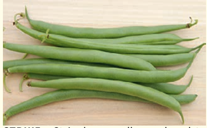
STRIKE - Stringless small round pod to 14cm, heavy yielding. 55-60 days. Eden Seeds: Packet 120 seeds $3.70, 400g $10.00, 800g $17.80, 4kg $90.00

Eden Seeds: Packet 70 seeds $3.70, 400g $14.00, 800g $26.00, 4kg $110.00