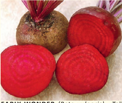
EARLY WONDER (Beta vulgaris) - Tall topped dark red variety, a favourite for greens, flattened globe shaped roots which may develop the attractive colour zones, good for summer planting, matures 55 days. Eden Seeds: Packet 270 seeds $3.70

Select Organic: Packet 160 seeds $4.20, 20g $7.00, 50g $11.00, 100g $20.00