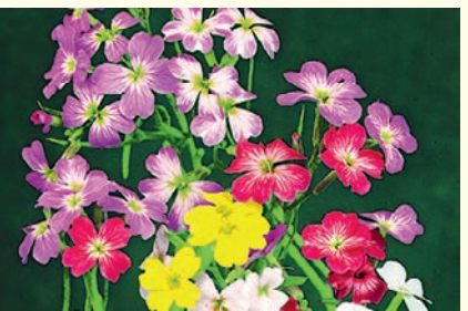
VIRGINIAN MIXED (Malcolmia maritima) Dainty highly scented flowers in pastel shades, dwarf annual plant to 30cm, brings colour to borders and children's gardens, full sun or tolerates shade, hardy in most soils, best sown direct, quick to mature.

A most popular hardy spring flowering biennial, grown as an annual, showy flower spikes, spring flowering, strongly fragrant, use in landscaping, borders and pots and as cut flower, prefers rich friable soils, sow mid summer to autumn, autumn only in warmer areas, direct sowing is rewarding.