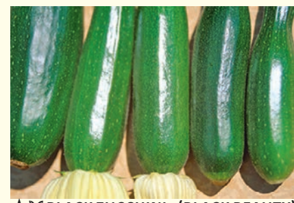
★% BLACK ZUCCHINI - (BLACK BEAUTY) Early bearing, uniform dark green, fine quality, bush type, cylindrical fruit. 50-63 days. Released in 1941.

Quick growing, popular vegetable. Likes rich well drained soil, though not heavily fertilized, add lime to obtain pH of 6.5. Keep moist. Can sow indoors 5 weeks before planting, take care not to damage roots. For seed saving it is best to grow only one variety within 2km. Pick whilst still small at about 15cm. Sow after frost or indoors 5 weeks before transplanting. Seed count: 6-12/g.