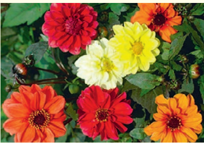
REDSKIN MIXED - Red bronze double flowers, dwarf plants 35-60cm, suited to pots. (We cannot send to WA.)

Annual, leaving bulbs for replanting next season, likes full sun, nip finished flowers for extended flowering time, average well drained soil, sow spring and summer for late summer and autumn flowering.