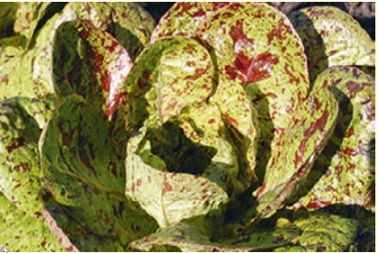
★ FRECKLES - Cos type, light green, with distinctive red splashes.