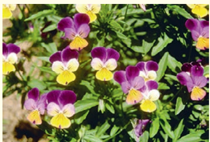
%HEARTSEASE - (WILD PANSY) -

Old English flower, native of Spain, in older times used for its potency in love charms, such as in the "A Midsummer Nights Dream", edible flowers are purple violet and yellow with long flowering time, annual with medicinal uses, also know as "Johnny Jump Up", full sun or part shade, rich well drained soil, extend flowering by deadheading, sow after frost or in punnets earlier.