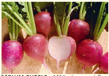
★ PLUM PURPLE - Mild crisp sweet firm white flesh, bright purple skin. 28-30 days. Eden Seeds: Packet 180 seeds $3.70

Select Organic: Packet 160 seeds $4.20, 10g $6.00