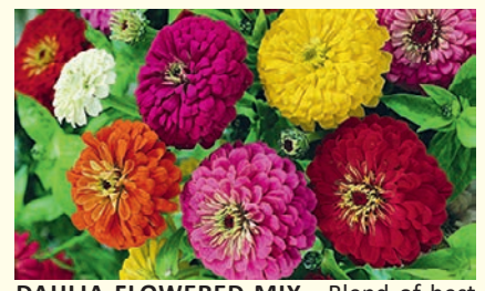
DAHLIA FLOWERED MIX - Blend of best colours, double flowers on strong stems, plants to 1m. Seed count: 140/g. Eden Seeds: Packet 200 seeds $3.70, 10g $8.00, 50g $28.00