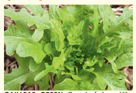
<u>OAK LEAF - GREEN</u> - Open leaf, shaped like oak leaf, sow anytime but summer. Eden Seeds: Packet 200 seeds $3.70, 5g $6.00, 20g $16.00

Eden Seeds: Packet 200 seeds $3.70 Select Organic: Packet 200 seeds $4.20, 5g $7.00, 20g $19.00