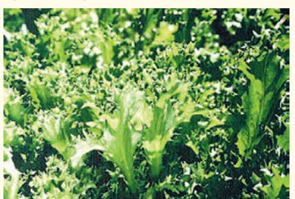
SALAD KING - Large dark green curled leaves, vigorous and hardy, resists bolting, tolerates frost. 90 days.

Select Organic: Packet 160 seeds $4.20, 5g $6.00, 20g $18.00