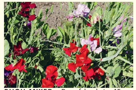
<u>BIJOU MIXED</u> - Dwarf bush to 45cm, fragrant and prolific, ideal for borders. Seed count: 10/g.

Fragrant spring flowering annual, used as cut flower, native to Italy, sow mid summer to late autumn, spring in cooler areas.