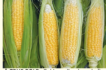
★ TRUE GOLD - Golden yellow kernels, fine flavour. 1 to 2 cobs on medium sized plants. 80 days. (We cannot send to WA.) Eden Seeds: Packet 100 seeds $3.70

Eden Seeds: Packet 80 seeds $3.70, 400g $17.00, 800g $23.00, 4kg $100.00, 20kg $400.00