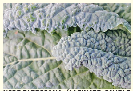
NERO DI TOSCANA - (LACINATO, CAVOLO PALMIZIO, BLACK CABBAGE) - Long dark green leaves heavily blistered appearance abundance produced from the centre of the

plant. Flavour enhanced by frost. Eden Seeds: Packet 120 seeds $3.70, 5g $6.00, 20g $19.00